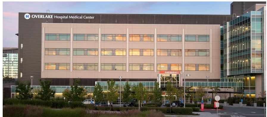
Overlake's Emergency Department is open 24 hours a day, 7 days a week. No one is turned away due to inability to pay.

Thank you again for Tulalip Tribes' generous grant of [REDACTED] to support charity care for patients at Overlake Medical Center. I am writing to report on the outcome of the charity care program in the recently completed 2017 fiscal year (July 2016 – June 2017).