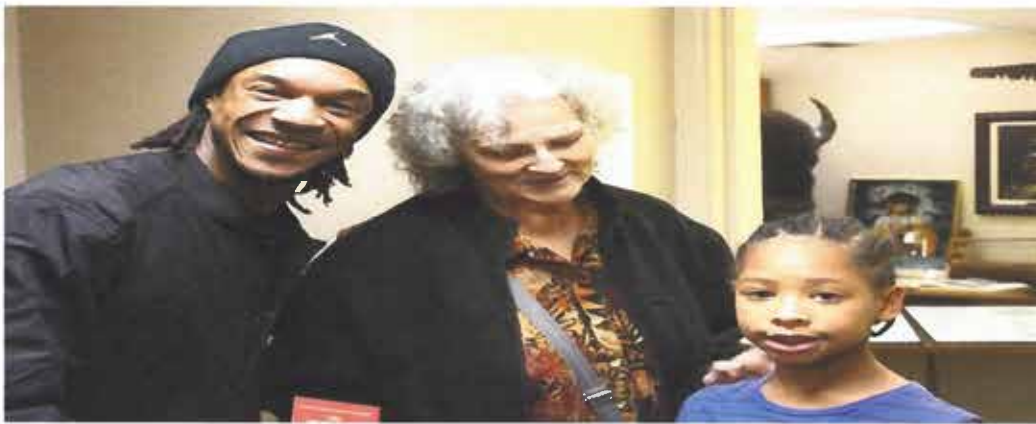
Our Baseball History and support for inter-city baseball