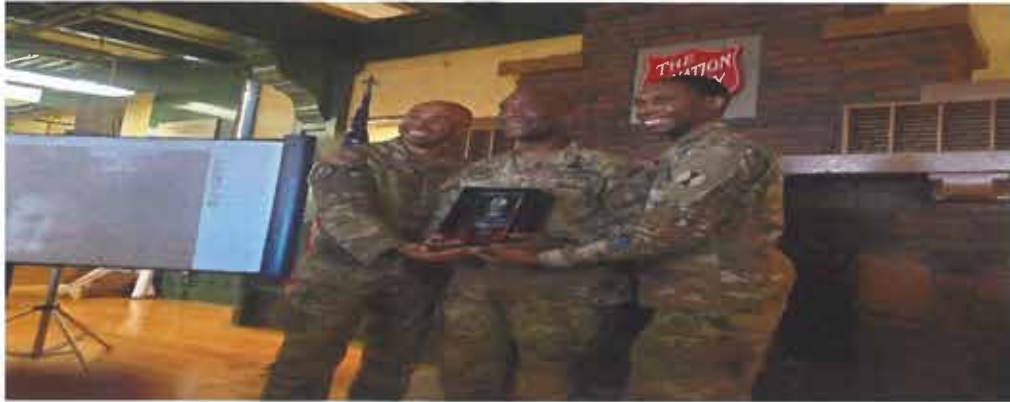
Support our Active Duty Military