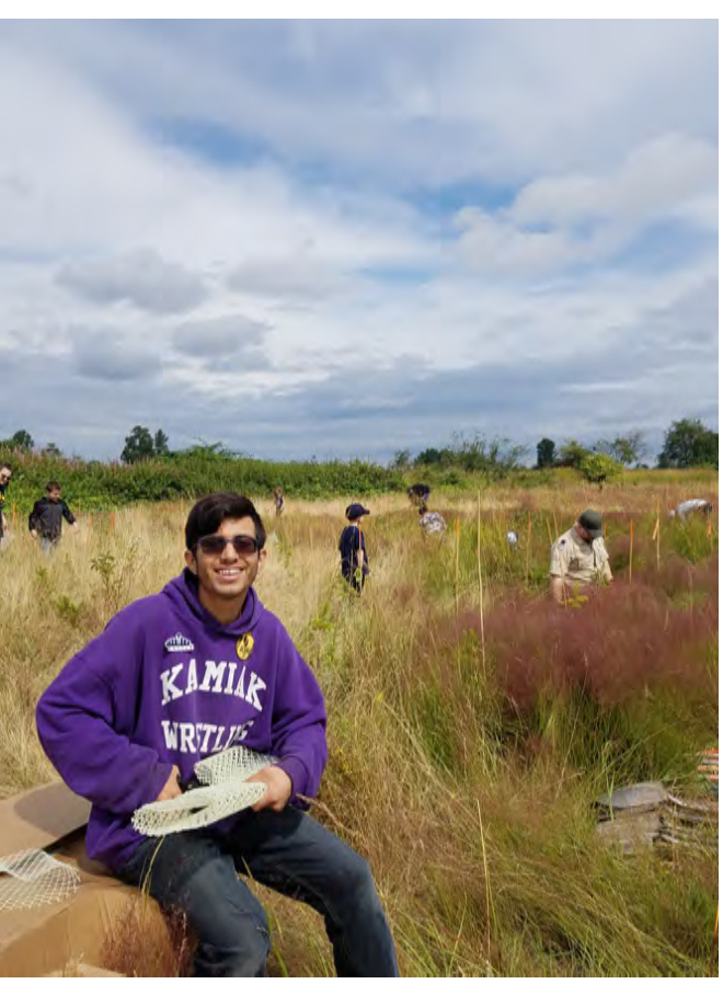
Volunteers putting on plant protectors