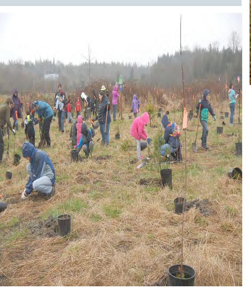
Volunteer Planting Event

Strawberry Fields Buffer Enhancement Project will improve water quality in Quilceda Creek by establishing a minimum of 100-foot wide buffers along 2,622 linear feet of Middle Fork Quilceda Creek. This project includes the removal of invasive vegetation and the restoration of native riparian vegetation to approximately 5.8 acres within the Strawberries Field for Rover Athletic fields and Dog Park owned by the City of Marysville.