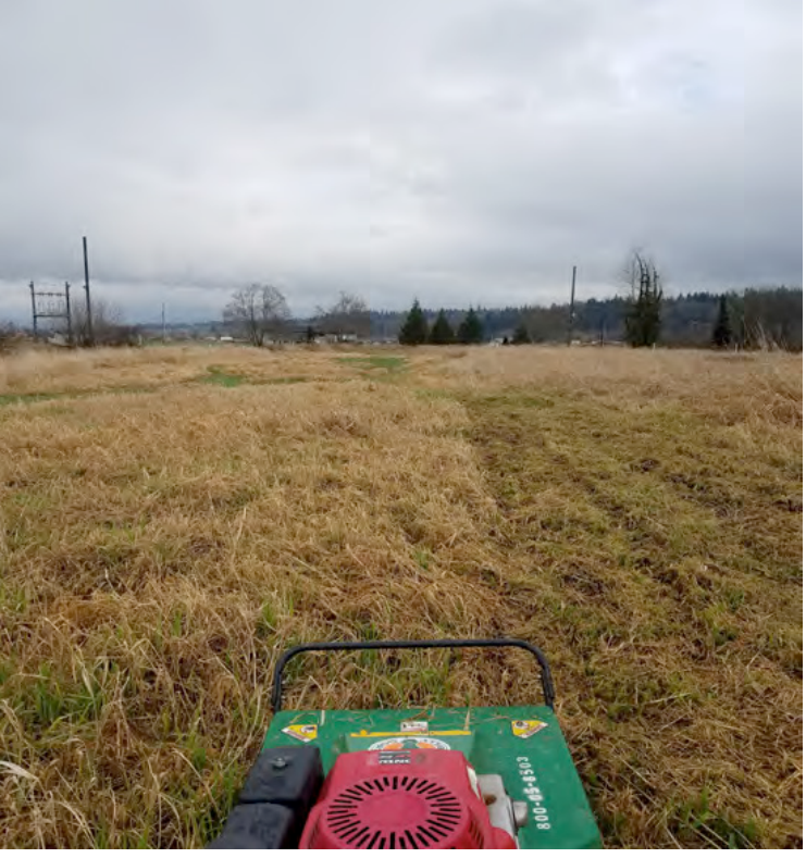
Vast field of reed canary grass getting mowed