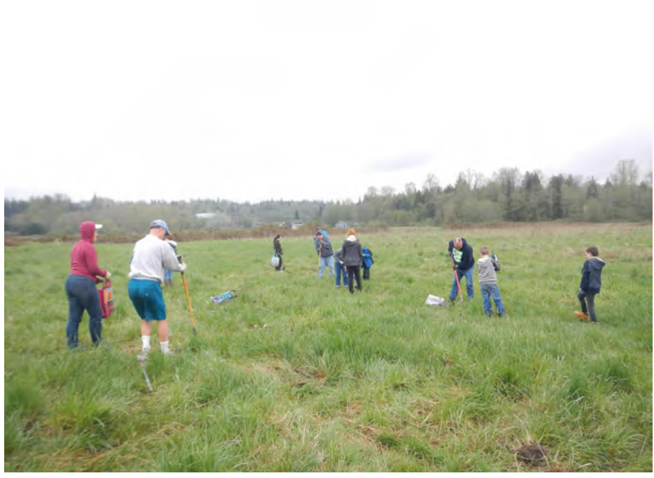
Volunteer planting event