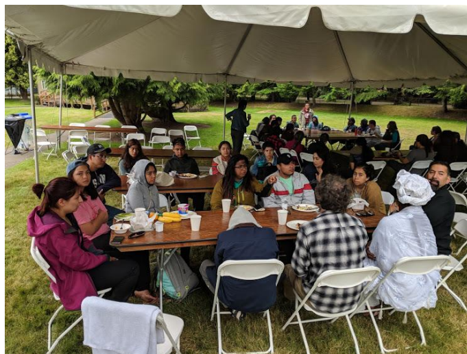
Members of the Moving Forward Network at the Protecting Mother Earth Conference, June 2018. Backbone Campaign helped host this contingent of Environmental Justice organizations from across the country.

Key stakeholder building happened because of this grant, including at the Moving Forward Network conventions last fall and Spring in LA and Charleston, at the Railroad Workers United convention in Chicago, at the South Sound Climate Convention in Olympia, and at an EESI stakeholder meeting in DC this Spring. We were able to grow alliances with many concerned about diesel pollution from freight, about shifting our fossil fuel economy, and about fixing a broken transportation infrastructure. The Moving Forward Network, a national coalition of Environmental Justice community based organizations, has officially sanctioned a Solutionary Rail Working Group.