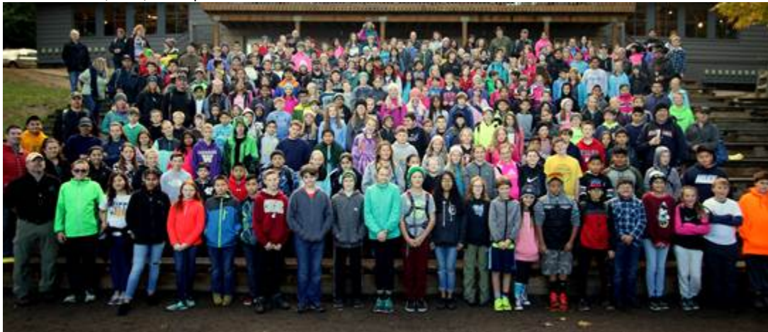
Allen School Burlington-Edison School District