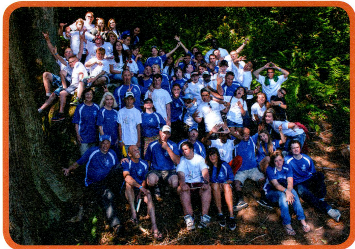
23rd Annual Camp Phoenix, August 2013