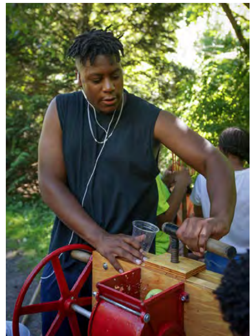
Top left: Volunteers harvesting apples. Top and middle right: Young people pressing apples during one of our summer programs.

Garden Manager at the Danny Woo Community Garden in historic Japantown