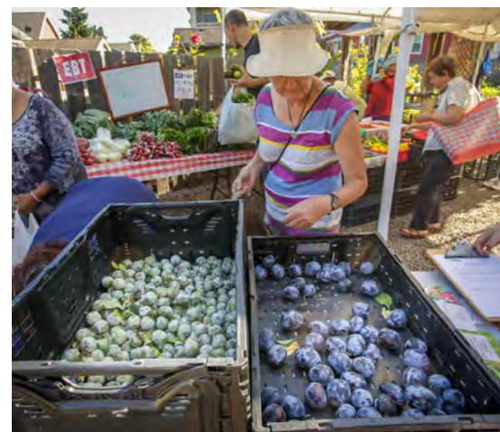
A Fruit for All event..

Our annual City Fruit Celebrates event brought nearly 200 people together, celebrating the end of another successful harvest season and highlighting our 20+ community partners.