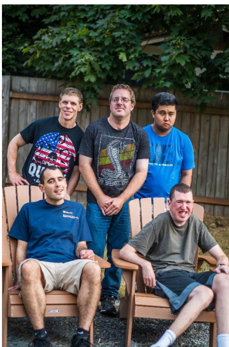
Five men who live in our Adult Family Home in Woodinville.

Community Homes is deeply grateful for the support of the Tulalip Tribes Charitable Fund. With your generous grant award of [REDACTED] in August 2018 for general operating support, you have helped us provide the highest quality