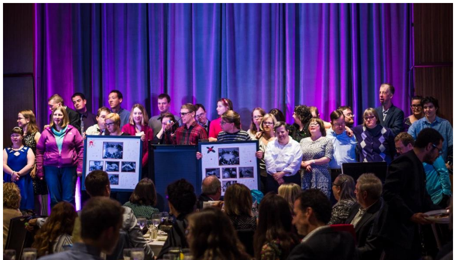
Our residents attend and are honored at our annual Autumn Gala. This year our event will be held on Saturday, Oct.12, 2019 at Meydenbauer Center in Bellevue.