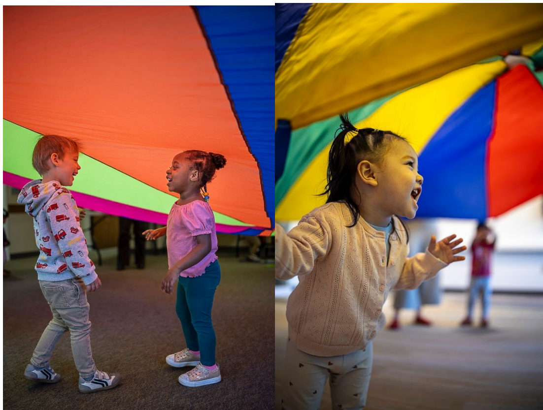
Children play the parachute game during Play & Learn at our Lake City and Columbia City location.