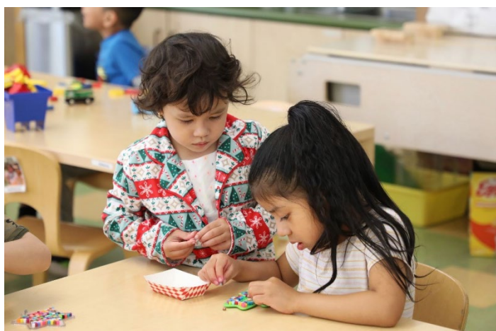
Two students play together at our Beacon Hill center.