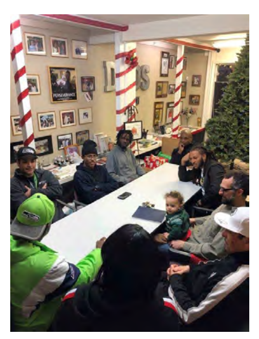
Figure 4 DADS Group Session