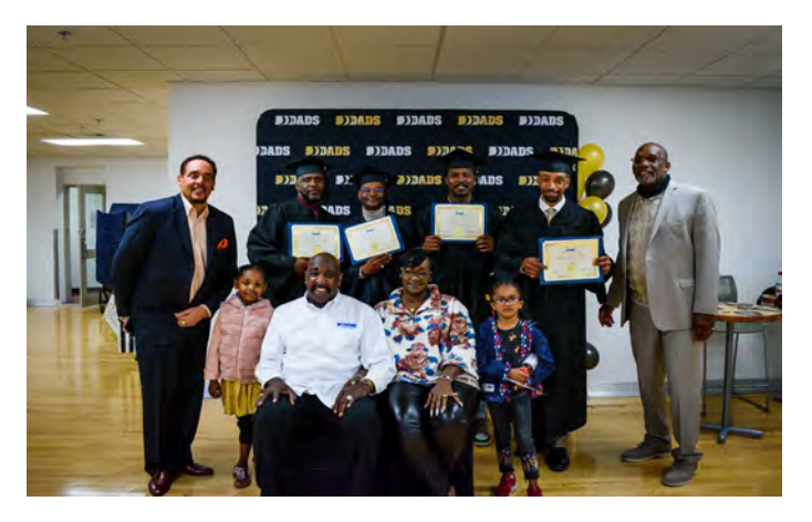
Figure 1 Becoming DADS Parenting Class Graduation May 2022