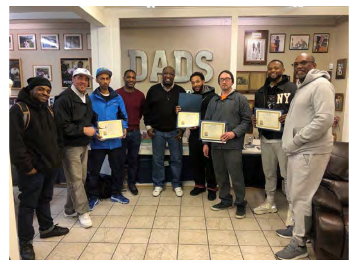
Figure 3 Becoming Dads Parenting Class Graduates