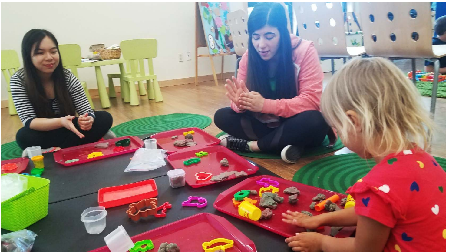
High school interns helped in program delivery and the development of communication skills and relationship building for toddlers.

It was required of caregivers to be present the whole time for supervision, engagement and support. This encouraged them to further explore natural concepts with their toddlers outside of the program. Many shared their gratefulness for the ease of incorporating seasonal themes, songs and activities into their daily lives. Ending lessons with a focused outdoor exploration also helped them make direct connections with their natural environment and provided more ways to make discoveries with toddlers during their typical outings. The no-cost factor and consistency of meeting dates and times was another plus for caregivers.