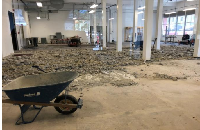
Concrete removed from main floor gallery space