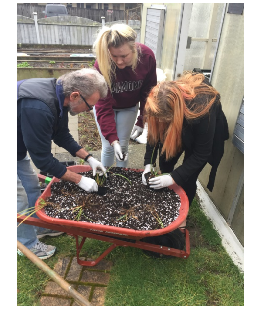
Our April 22, 2017 Earth Day event drew a crowd of all ages as plants were both planted and taken home to plant in their own gardens.