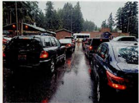
We're here rain or shine