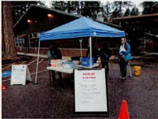
All hands on deck