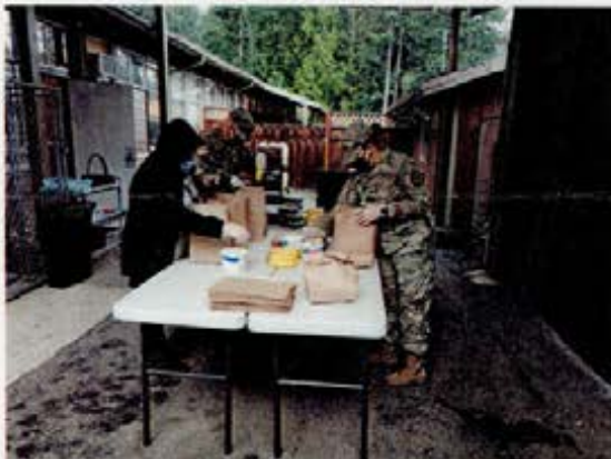
The National Guard have been priceless