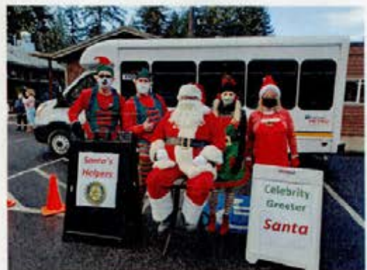
Santa and his Singing Elves