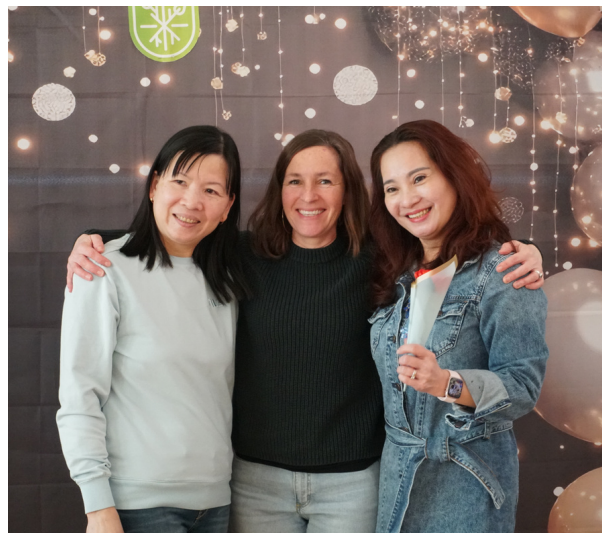
Family Program Celebration