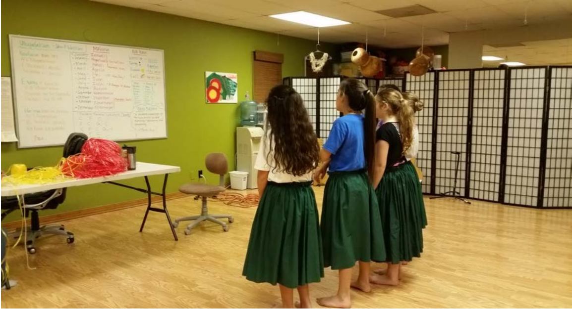
`Ōlelo Hawai`i Language lesson learning and oli (chant)