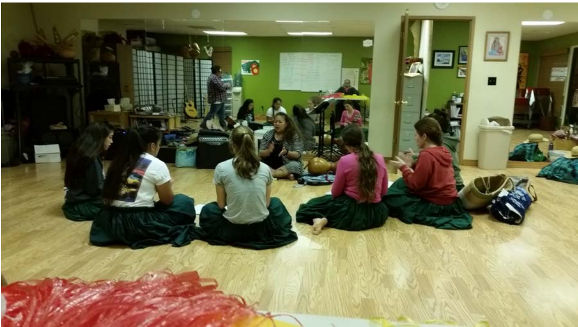
`Ōpi`o (teens) having a `ōlelo (language) class