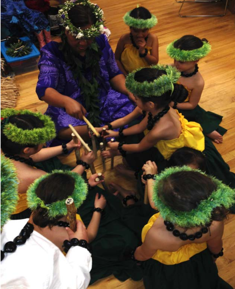
Keiki playing a word game with their kala`au (sticks)