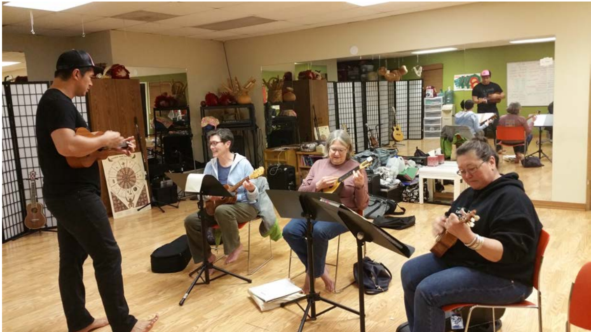
Papa ukulele with kūpuna (elders)