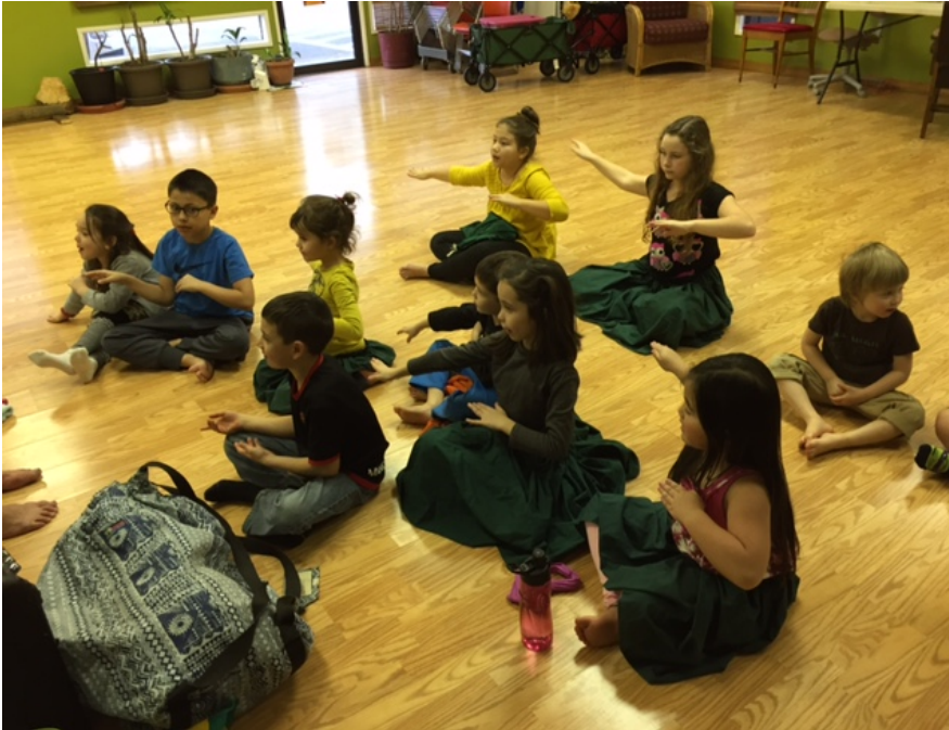
Teaching my babies Ke`ao Nani (our beautiful world)