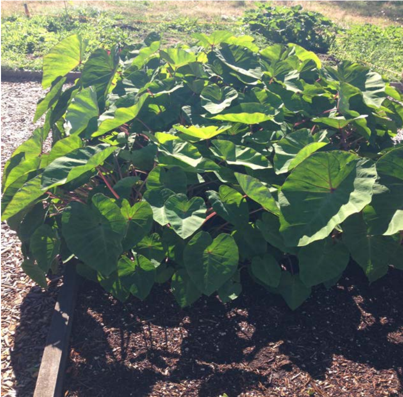
Grown Kalo (Taro)