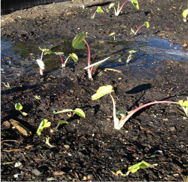
Baby Kalo (Taro)