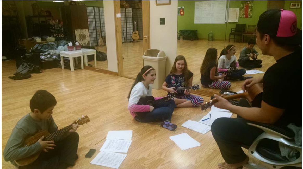
Papa keiki ukulele classes