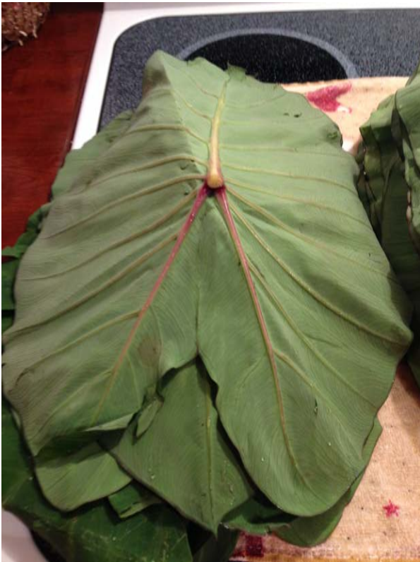
Kalo (Taro) Leaves