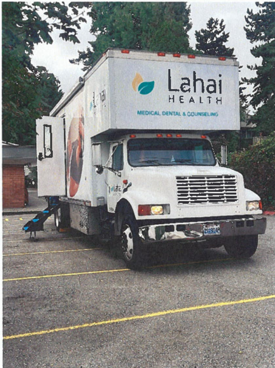
Lahai Health's Mobile Medical Unit parked at Connect Casino Road