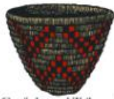
Confederated Tribes of the Chehalis Reservation