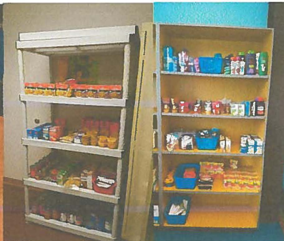
Food Pantry @ MPHS ~ Food Pantry @ ISC GHS

The program continues to thrive thanks to great collaboration between dedicated volunteers, the school districts, community members and foundations. The Tulalip Tribes, who were integral in getting this program started, continue to play a large role through their financial support.