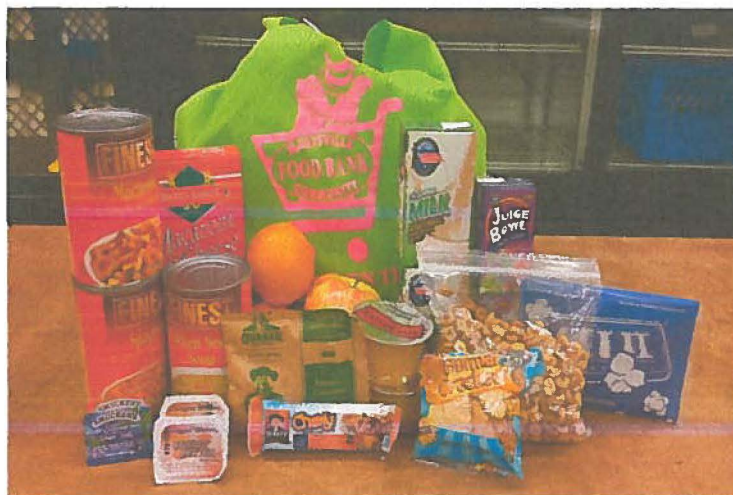
A sampling of what goes into a food pack

The funds were put to great use toward feeding our hungry children within our community. The funds that you provided were used to purchase food for the Food For Thought Backpack Program. During the 2015 we provided over 12,000 bags of food to elementary students. We served 13 different schools between the Marysville and Lakewood school districts.