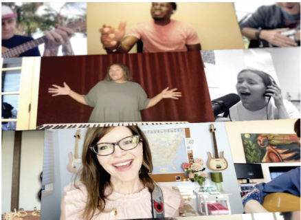
ROCKSTAR SONG REQUESTS