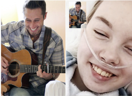
1:1 MUSIC THERAPY SESSIONS