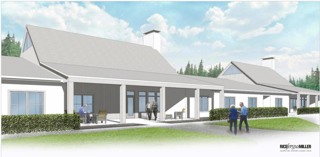
One of the architect’s views of our longhouse – three homes under one roof.