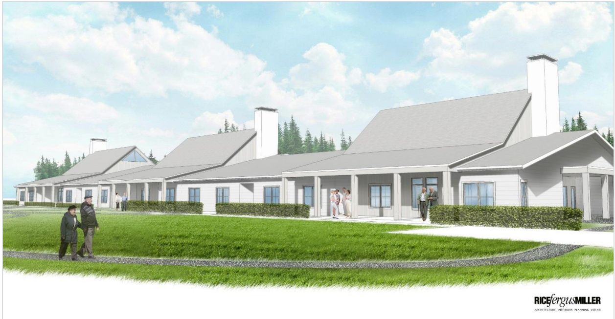
Another view provided by the architects.