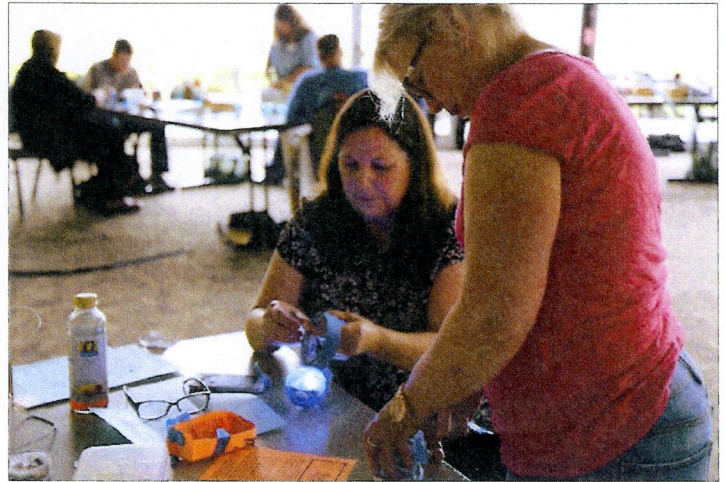
Teachers receiving professional development around Sphero robots as part of STEM & NGSS

Thank you for your continued partnership with us here at Northwest Educational Service District 189. We are grateful to be working to gather to support the students, teachers, and staff of our 35 member districts and their 165,000 students. Please let me know if there is any other information you require.