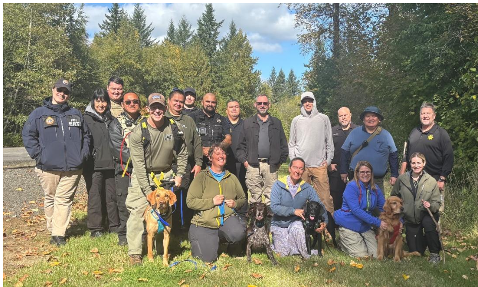
Tulalip Tribal Police, Fish and Wildlife Police, Northwest Human Remains Detection Dogs