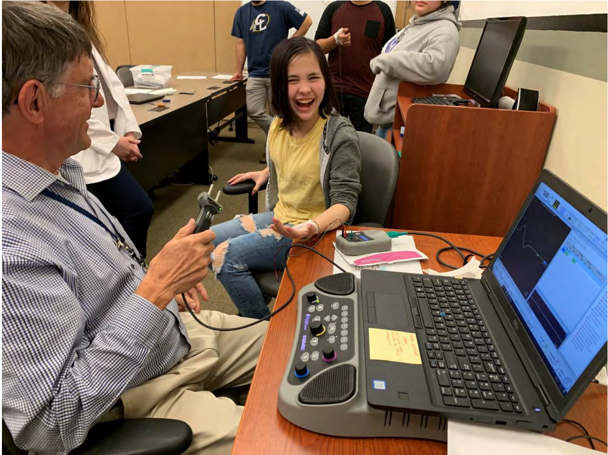
Figure 4 PNWU faculty using the EMG machine with RTW participants in session #5.