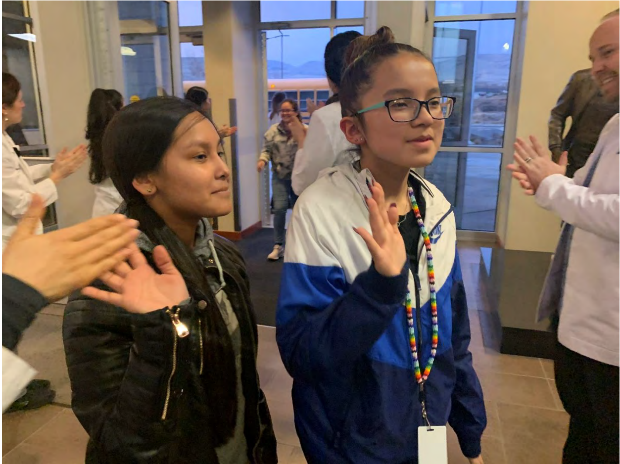
Figure 1 RTW students walking through the Welcoming Tunnel in Butler Haney Hall before a session.