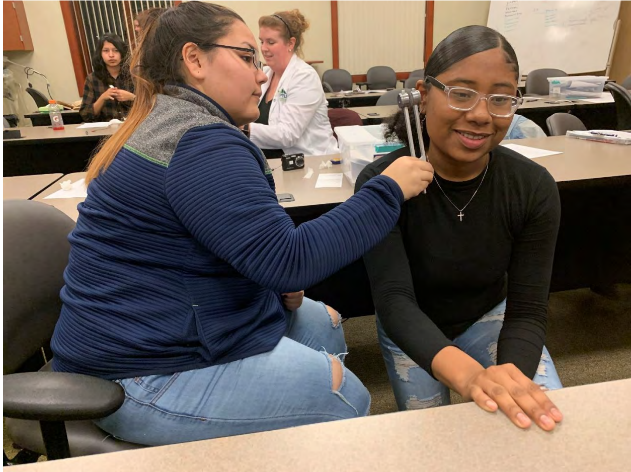
Figure 9 RTW students testing hearing during session #5.