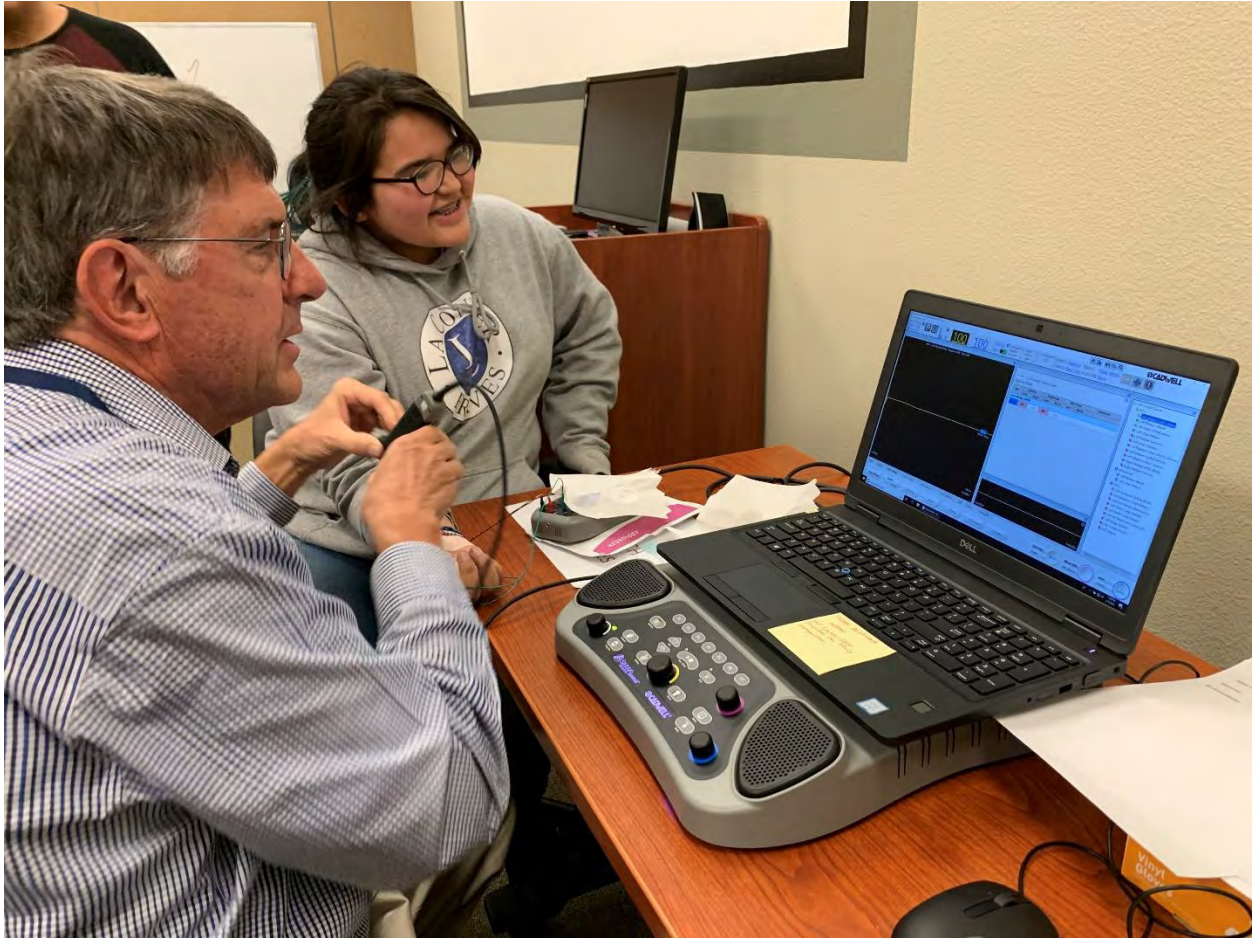
Figure 5 Students learning how to use EMG machine in session #5 with PNWU faculty.