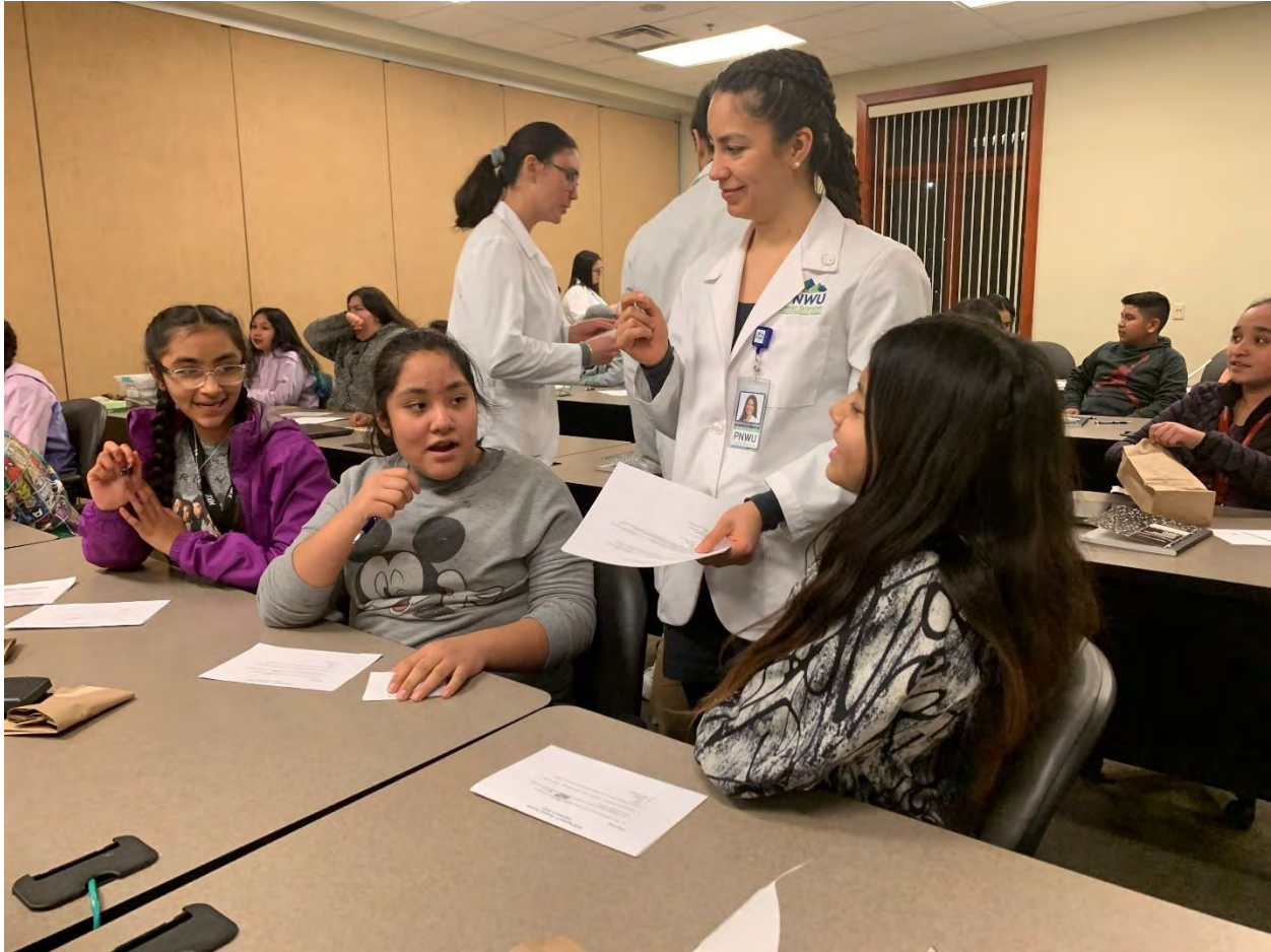
Figure 8 RTW co-mentors testing during a session.