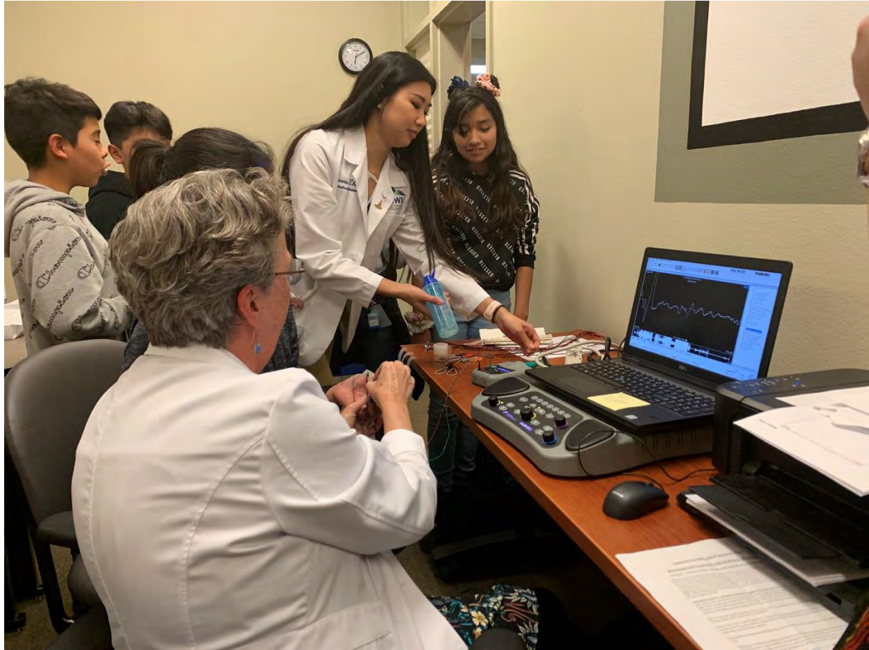
Figure 6 PNWU mentors and faculty showing RTW students how to use the EMG machine during session #5.