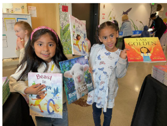
Students from Pathfinder Elementary, Mukilteo

Summer slide accounts for two-thirds of the literacy opportunity gap experienced by children from families in majority low-income communities. Much of the reason for this problem, according to researchers, is due to lack of easy access to books in the home. But Book Up Summer ensures children have literally fingertip access to books—books that they got to choose themselves and that reflect their interests and reading levels.