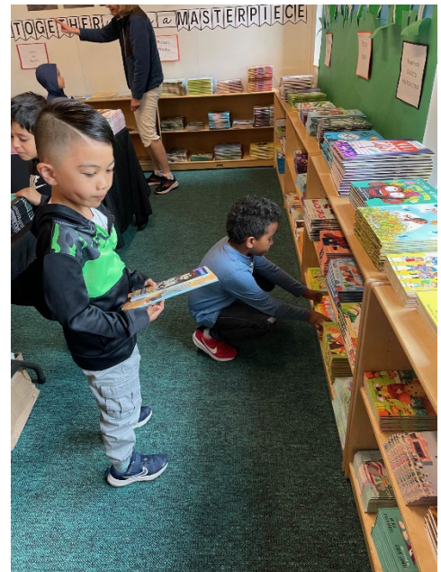
Students choosing new books for summer reading at Pathfinder Elementary.

Through Book Up Summer, Page Ahead gave 23,638 Washington students 299,636 books for their home libraries in 2024-25.