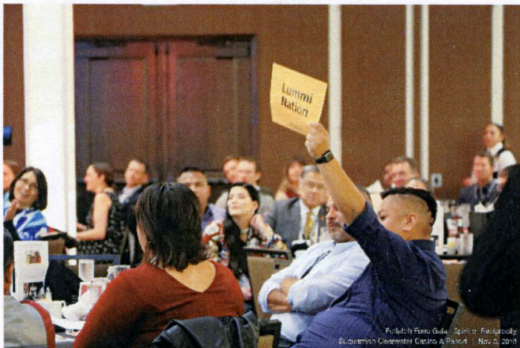
2018 Raise the Paddle - $92,205.05 NEW Record