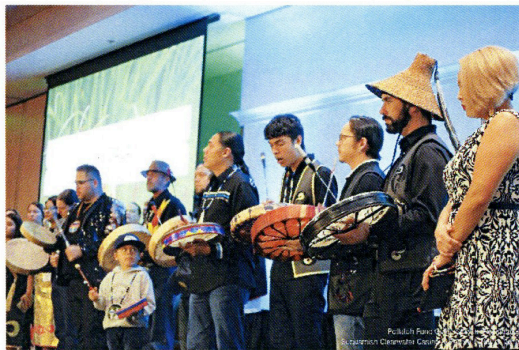
2018 Welcome Song: Sacred Water