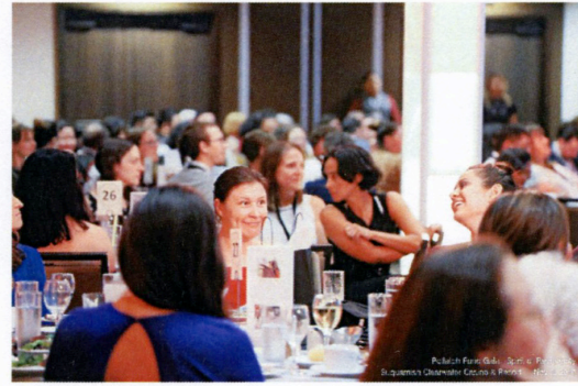
2018 Dinner with Program