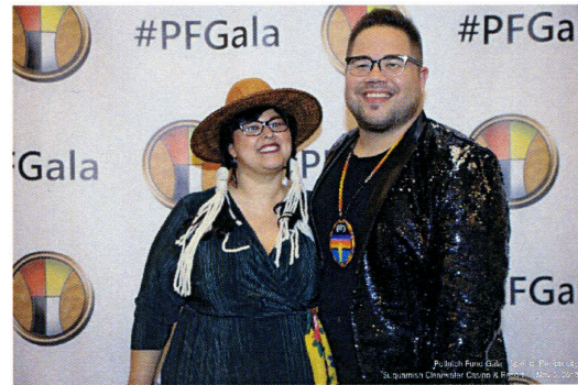
2018 Mistress & Master of Ceremonies