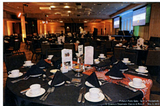
2018 Canoe Ballrooms