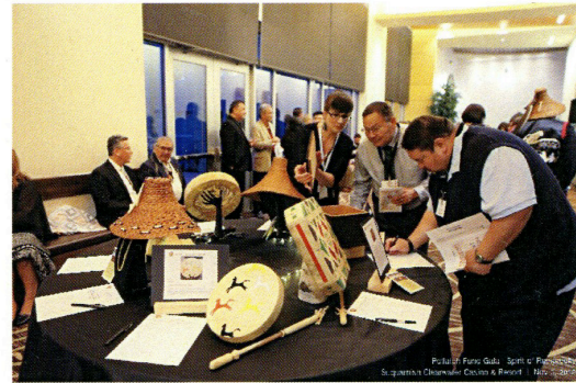
2018 Silent Auction with Reception