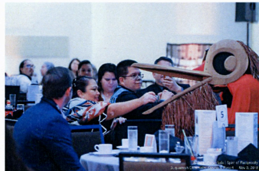
2018 Mosquito Beggar Mask - Eweye Family