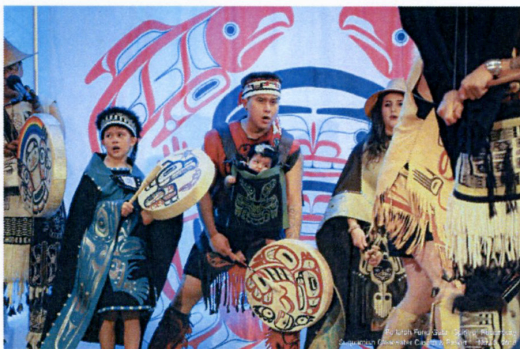
2018 Cultural Demonstrations - Git Hoan