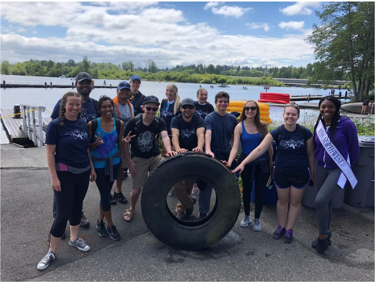
Page 5 of 6 ■ Puget Soundkeeper