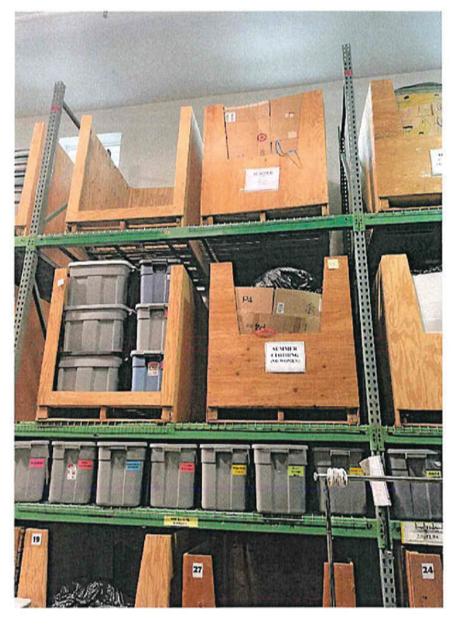
Page 4 of 4 ■ Puyallup Valley St. Francis House