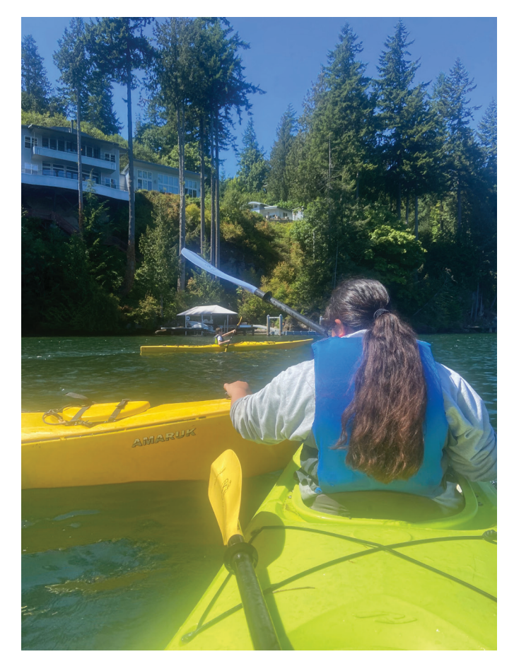
Page 4 of 4 ■ Rebound Families