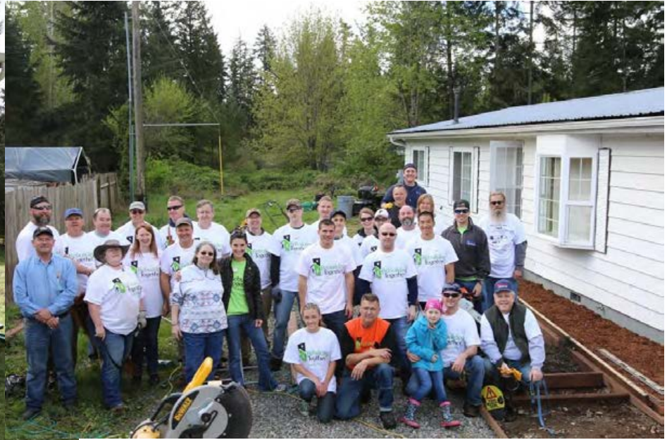
Before and After photos of a completed Rebuilding Day 2015 Ramp