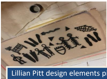
Lillian Pitt design elements picked up and rolled onto a glass bubble