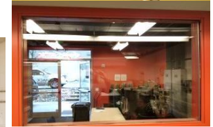
Window installed for view of alley entry & NEW custom built double-annealer