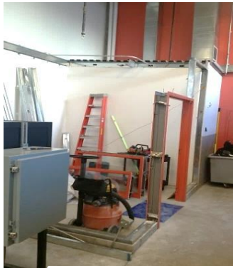
Removal of the Hot Shop Office