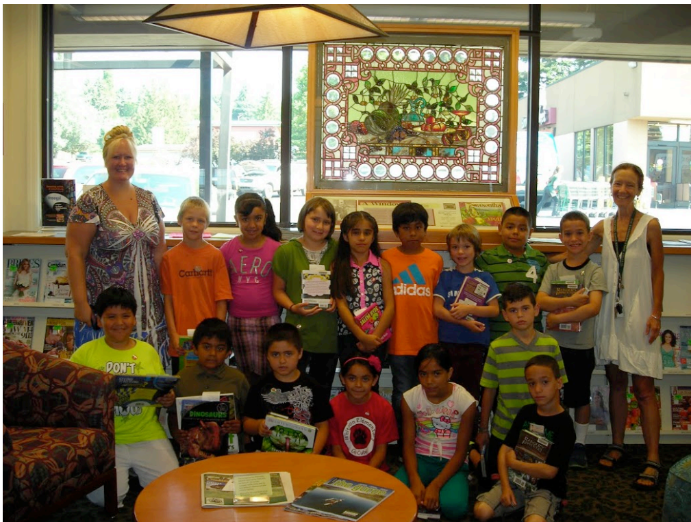
2014 Feed Your Brain program in White Salmon, WA

For more information about Feed Your Brain, contact Clifford Armstrong III at carmstrong@schoolsoutwashington.org or at (206) 336-6915 or visit our website at www.schoolsoutwashington.org .