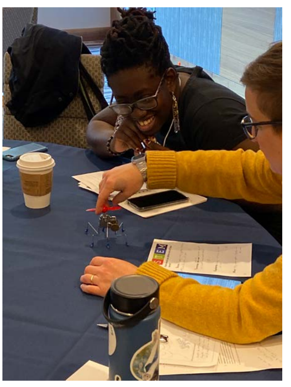
Page 4 of 4 ■ School's Out Washington