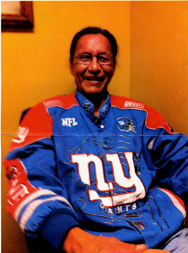
Our case management team works with Chief Seattle Club to assist Native Americans in need of eviction prevention and other services.