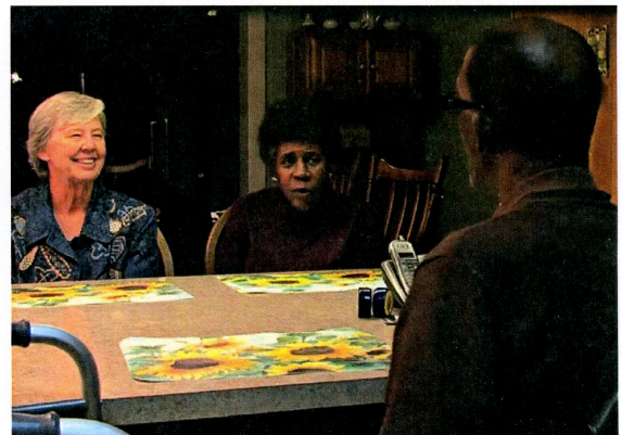
SVdP volunteers (Vincetians) make "home visits" to understand people's needs and provide assistance.