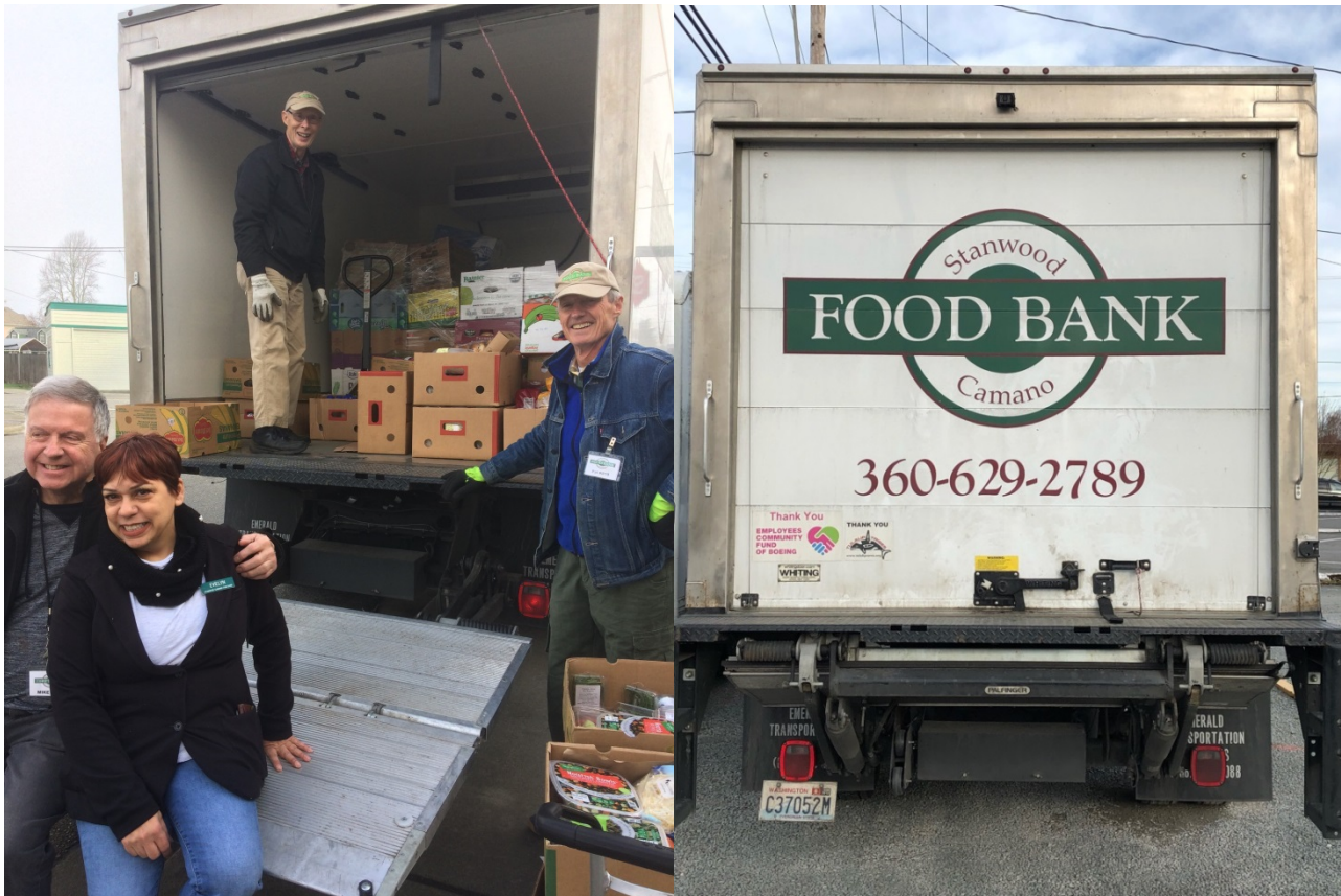
Some of our volunteers unloading a grocery rescue pickup.