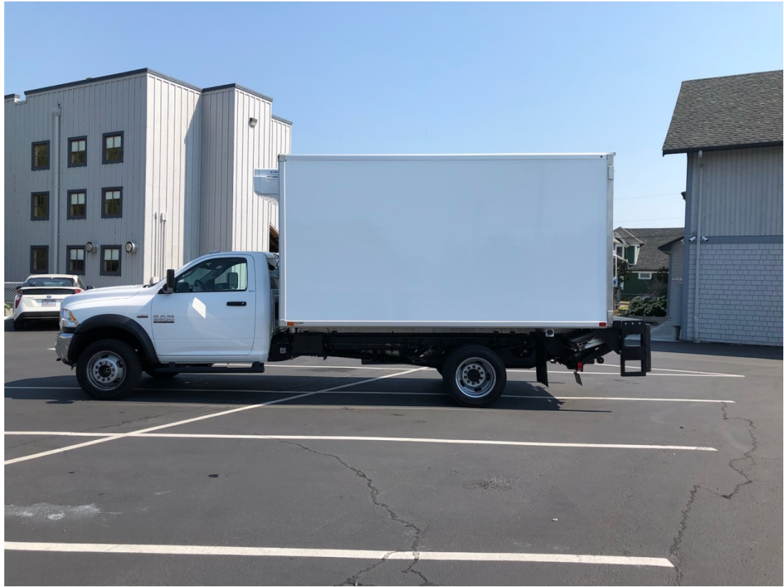
Our brand new refrigerated truck before the logo was added.