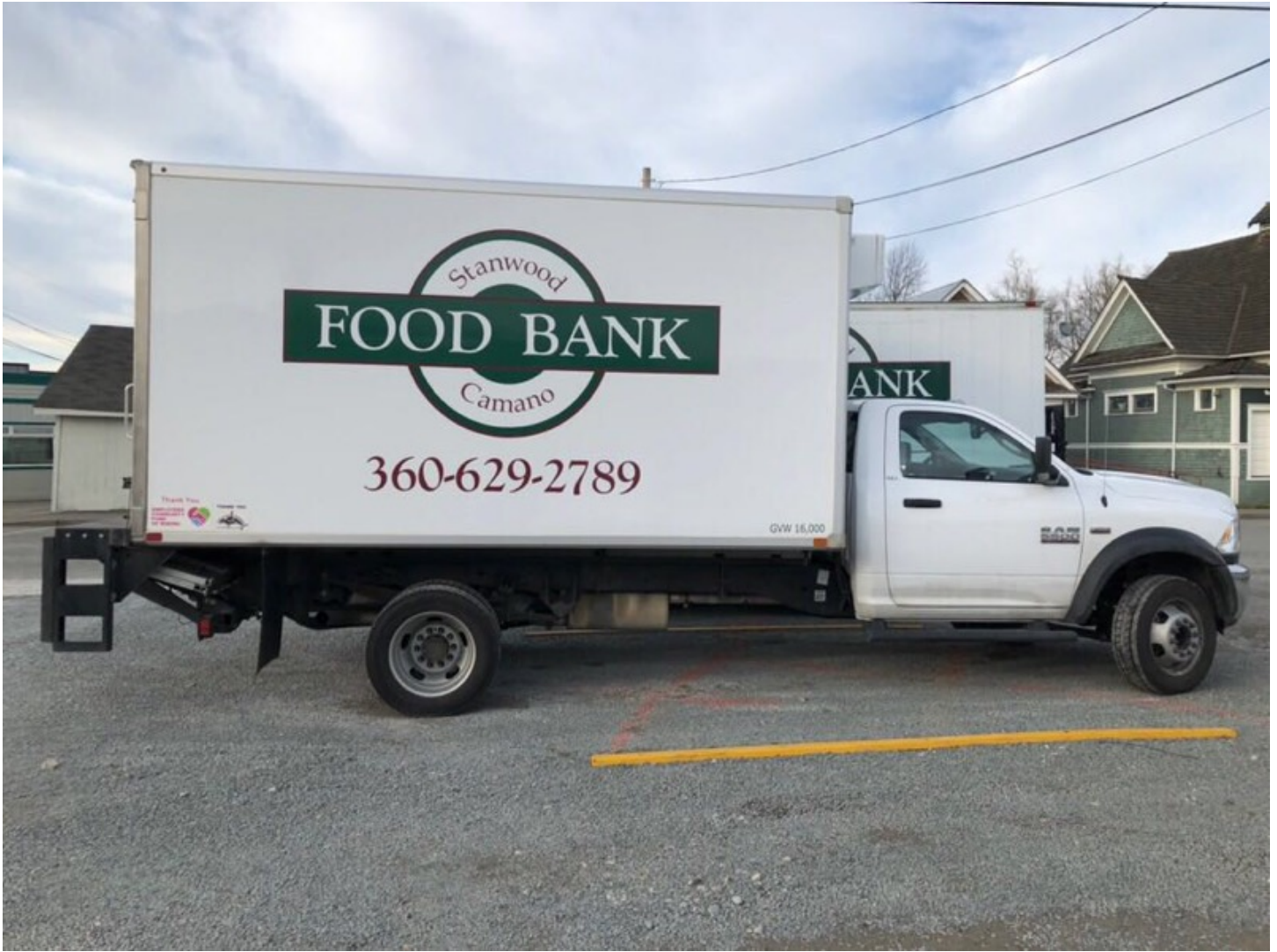
The truck with logos and stickers.