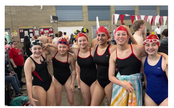
Page 3 of 4 ■ Storm Aquatics