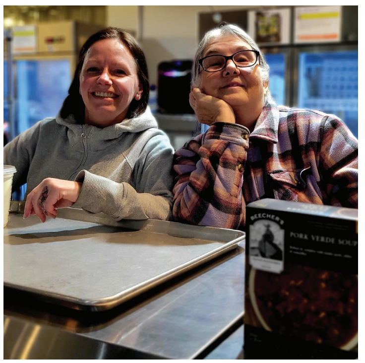
Page 7 of 7 ■ Sumner Community Food Bank