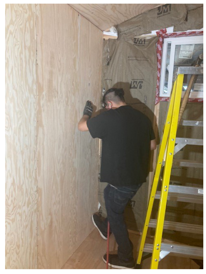
Page 5 of 5 ■ TERO Vocational Training Center