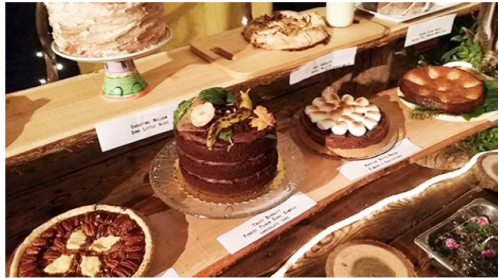
Locally made desserts, like a cake decorated with a banana slug, were up for grabs during the Saturday gala's dessert dash event.