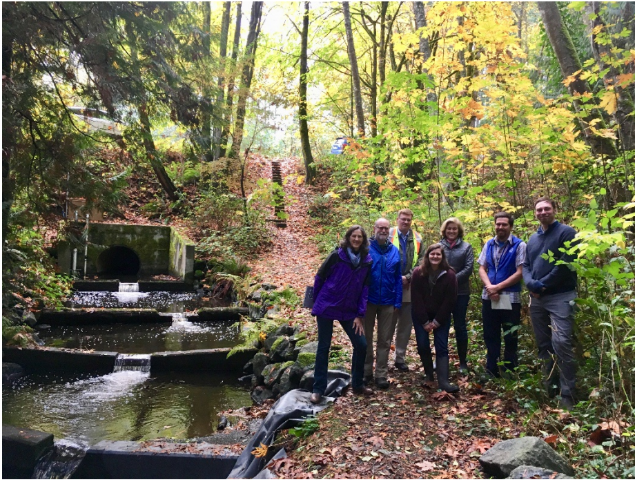
Senator Christine Rolfe toured conservation priorities for salmon habitat in her watershed with the Bainbridge Island Land Trust.