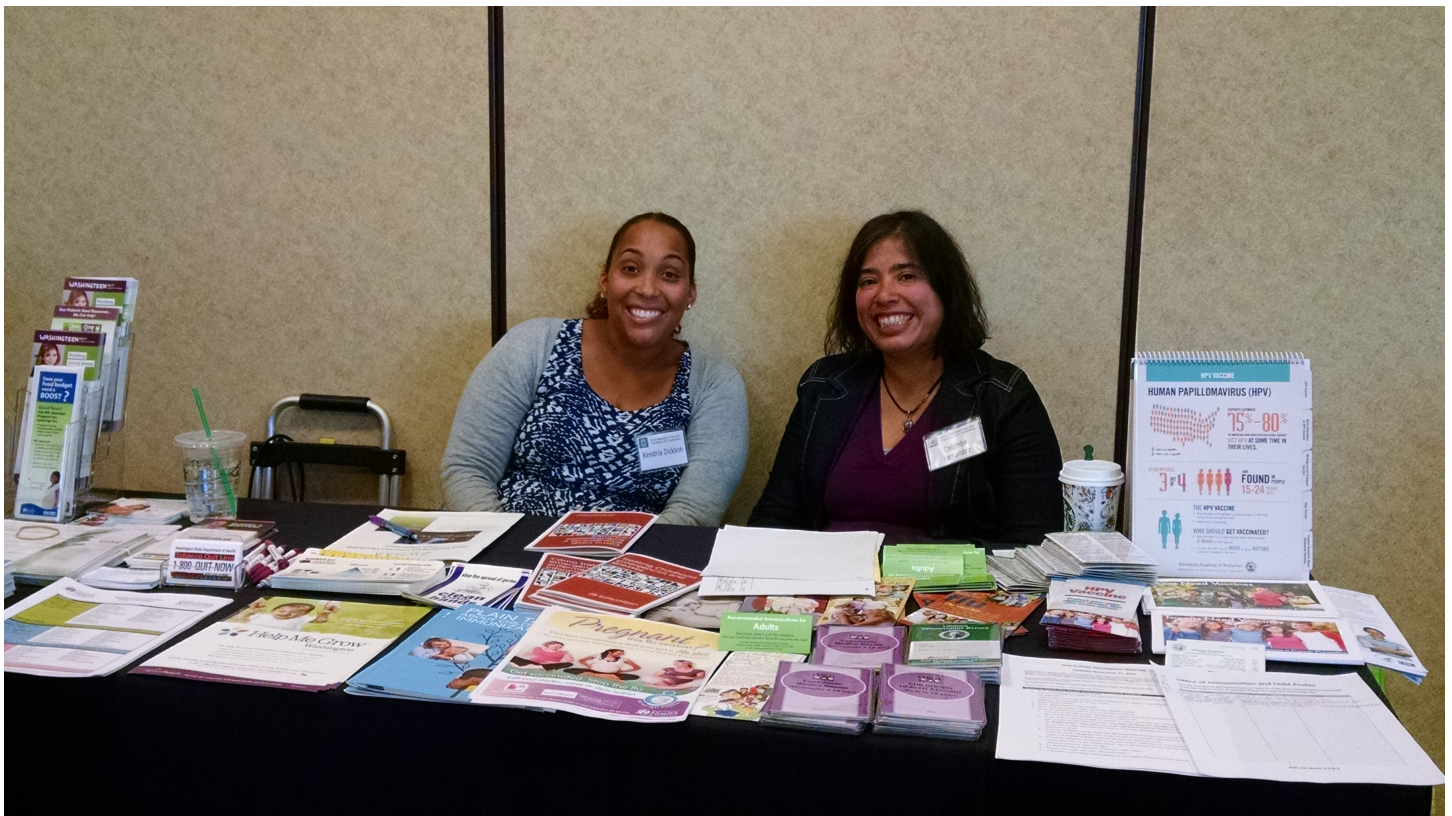
Washington State Department of Health exhibitors at the 2015 Washington Free and Charitable Care Conference

In 2014, Washington State free and charitable clinics provided direct care to over 200,000 unique patients . Although this contribution is significant, there are still hundreds of thousands of Washington residents without access to reliable, affordable healthcare. Free and charitable clinics continue to develop and expand to meet these needs.