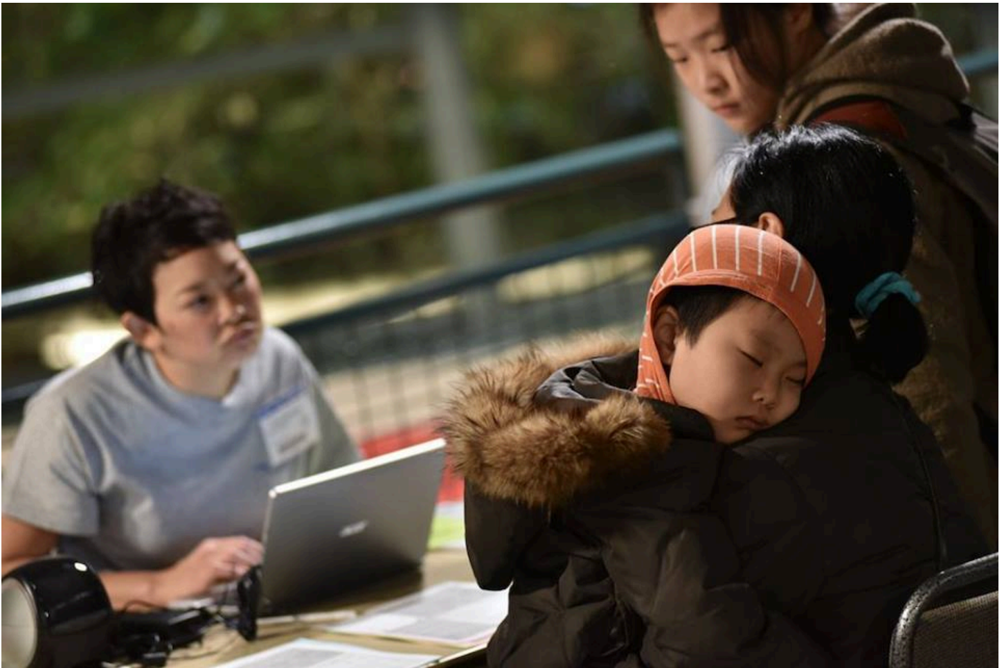
Patient registration at the Seattle/King County Clinic

Free clinics are independent nonprofits that meet community need at the grassroots level. Each clinic is individualized to serve local patients. Free clinics receive no government funding, and are staffed by licensed healthcare volunteers and dedicated community activists.