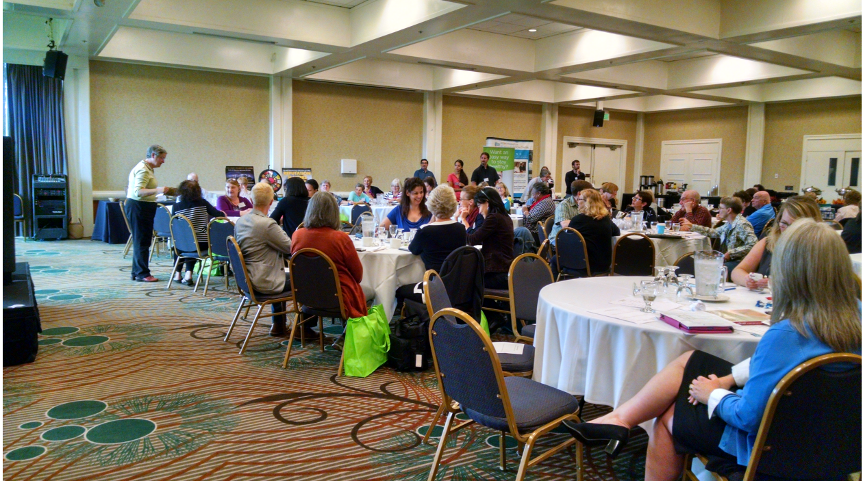
Attendees participate in rotating, small group discussions at the 2015 Washington Free and Charitable Care Conference