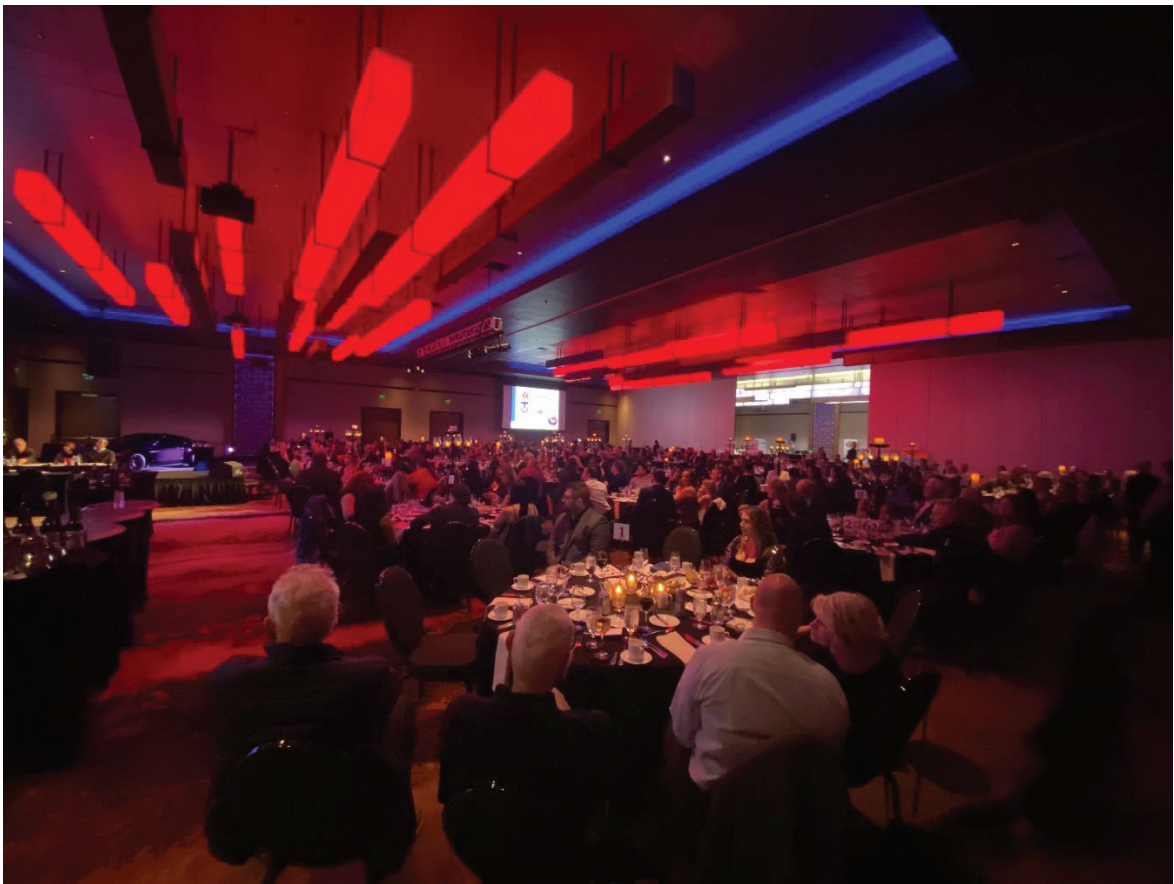
WIGA Gala Dinner