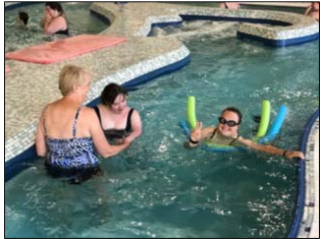
ABOVE: Swimming at YMCA