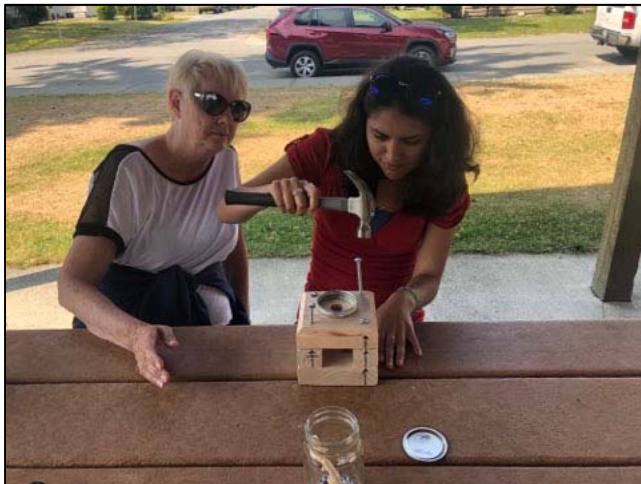
Building a Candy Dispenser at Maiben Park