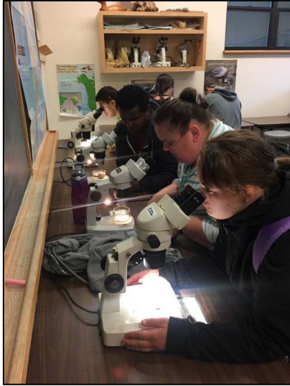
Workshop at Padilla Bay Interpretive Center