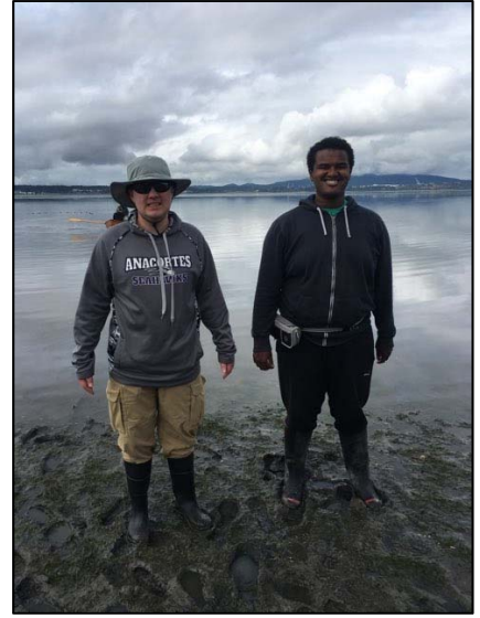
Padilla Bay Beach Seine Activity