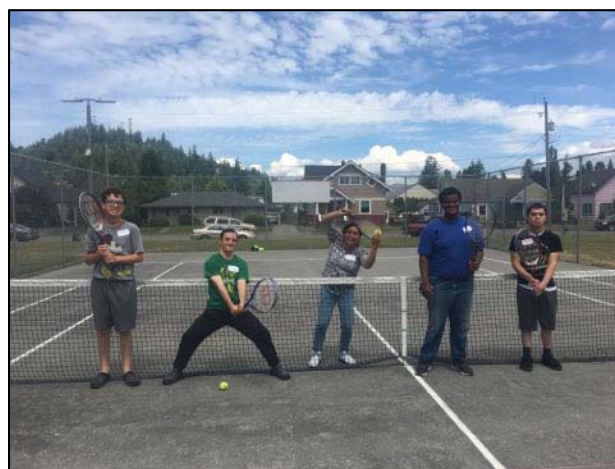
Tennis at Maiben Park