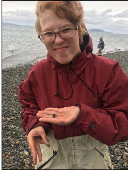
Camper Holding a Crab