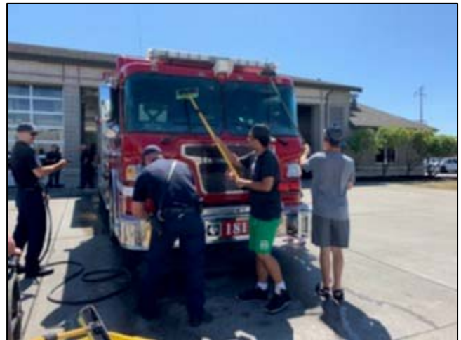
Washing Trucks at the Burlington Fire Station