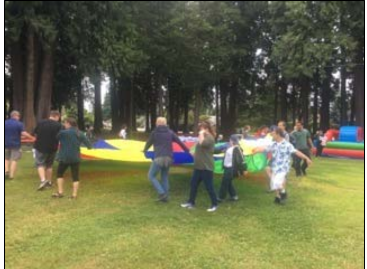
ABOVE: Parachute Team-Building Game