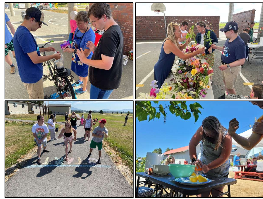
Week 4: Farm to Table

Left: Campers make milkshakes using a bicycle-powered blender at Bow Hill Blueberry Farm.