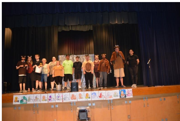
The entire crew after their successful live performance.