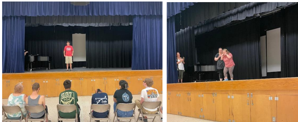
Campers practicing being on stage with an audience in an ice breaker to show their skills.

From July 8-11, the focus shifted to Theatre at Burlington-Edison High School. Campers had the unique opportunity to participate in creating a live theatre production. They learned about all aspects of theater-making, from set building and lighting to acting and directing. This week encouraged creativity, teamwork, and self-expression, allowing campers to build confidence and connect with their peers through the joy of performance.