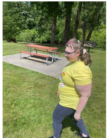
Camper participating in a very popular ABC Nature scavenger hunt.