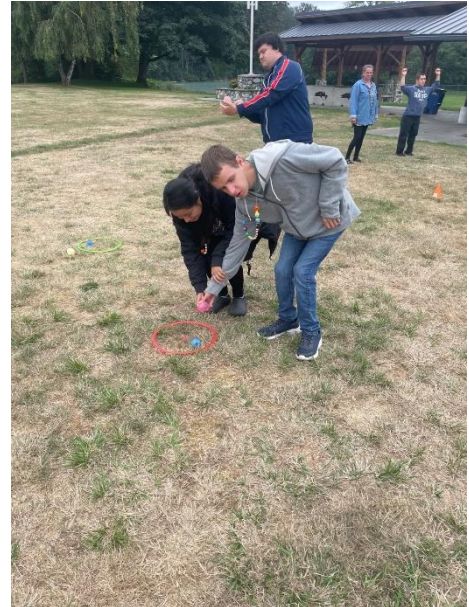
Campers participated in a variety of backyard games and challenges.