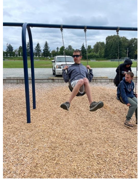
Riverfront Park's playground was popular amongst all campers.