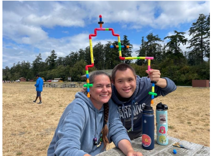
Campers and staff participating in fun, friendly competitions.