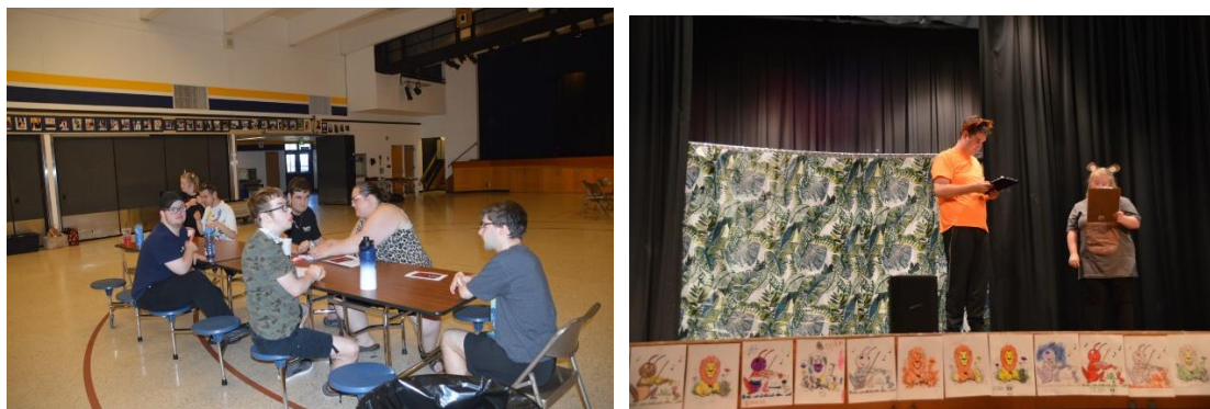
Left: Campers working on coloring sheets to enhance their set with their own personal touch.