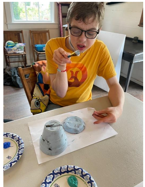
Campers engaged in garden related crafts to express their interest and abilities revolving around nature!