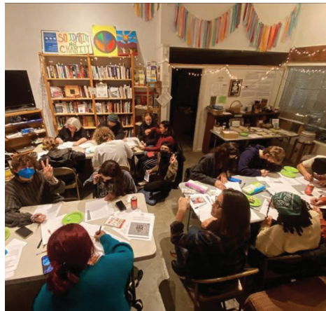
2023 Holidays for Prisoners

Community outreach and connection, local action, and group learning are ways that WPJC enhances our ongoing crucial work in Whatcom County. Our Alternatives to Military Service (AMS) program made a total of 28 school visits to public schools in Whatcom and Skagit counties in 2024. During school visits, our volunteer team made up of veterans and other community members had approximately 600 conversations with young people to discuss options outside of military service after high school. We also shared this information with youth at community events. This is the second year we were able to have a part-time AMS program coordinator. We were also able to fund a part-time program youth liaison in partnership with a youth homelessness prevention and advocacy agency in town. Such growth allowed us to reconnect with all but one high school in Whatcom County with whom we lost connection with during the pandemic. Additionally, we've expanded into tabling at some local college campuses