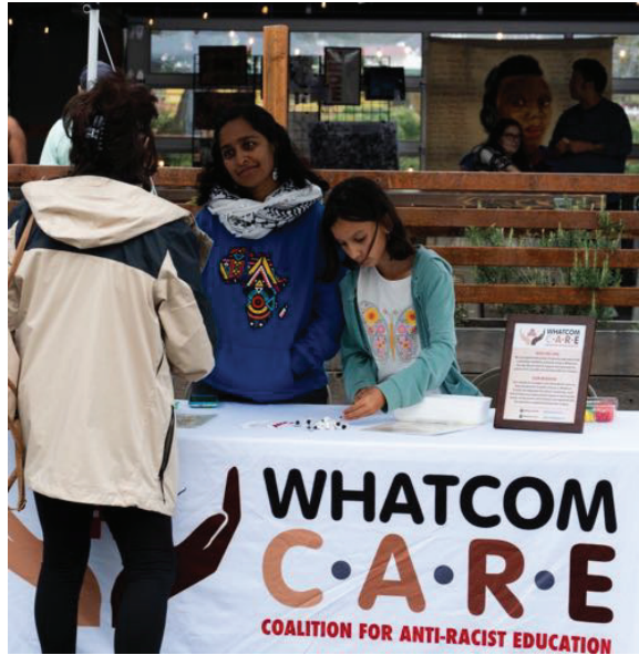
Whatcom CARE tabling at this year's Info Fair