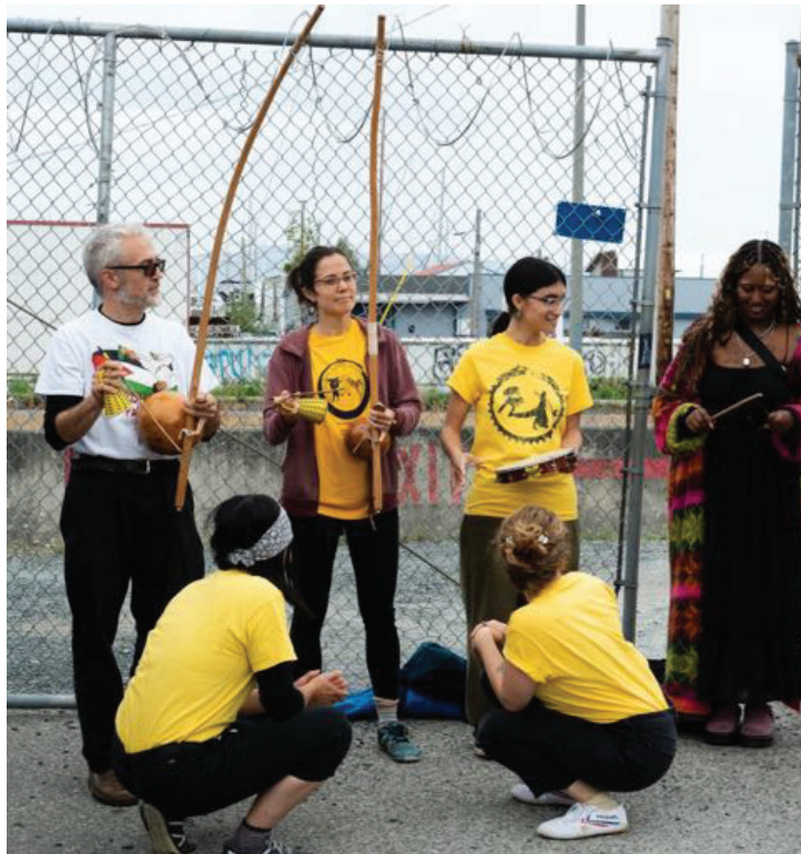
FICA Bellingham performing capoeira during our Info Fair