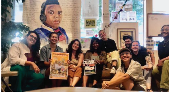
2023 TJLL Participants