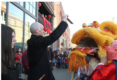
Lunar New Year. 2014. Rep. Adam Smith feeding the Lion at the Year of the Horse Lunar New Year celebration.

Support from the Tulalip Tribes Charitable Fund was instrumental in making The Wing's Lunar New Year 2014, Year of the Horse, such a success! Through our Lunar New Year festivities, The Wing immersed visitors in an educational and festive cultural experience that is quickly becoming a tradition for many families throughout the area. Our 4th annual program celebrated the diverse New Year traditions of Asian Pacific Americans through a neighborhood wide event, new exhibition, kids fair, and guided gallery and neighborhood tours.