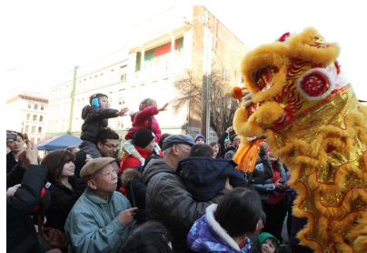
Lunar New Year. 2014. Lion dance at the Year of the Horse Lunar New Year celebration.